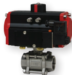
Model SN mounted to an actuator